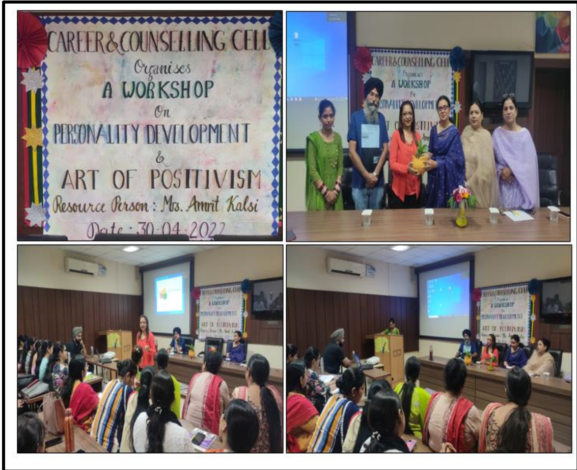
Workshop on Personality Development and Art of Positivism