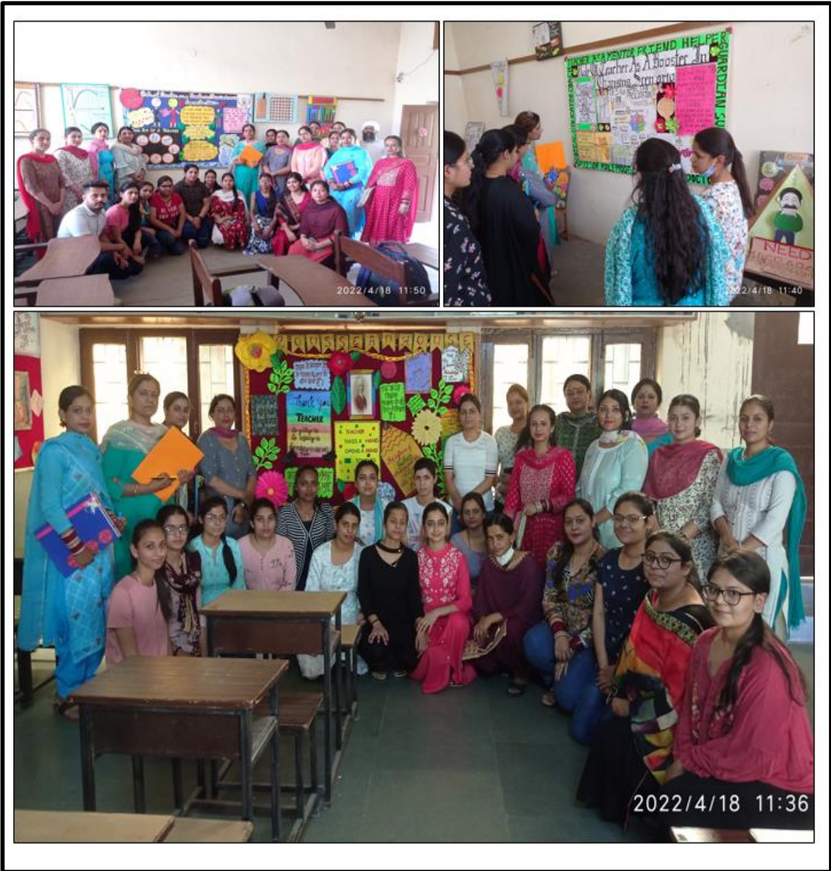
Thematic Display Board Competition