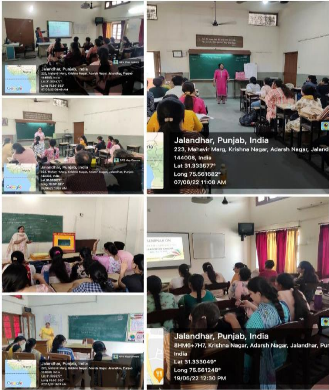
Demonstration by Teachers